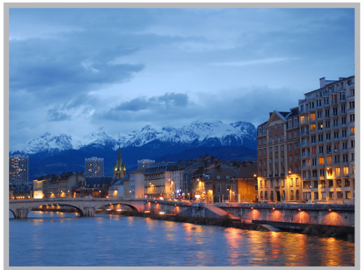
IM Francillon-Ville de Grenoble

At the end of each street lies a mountain...» As wrote Stendhal, Grenoble is surrounded by mountains, which offers a wide range of leisure activities in summer and winter.