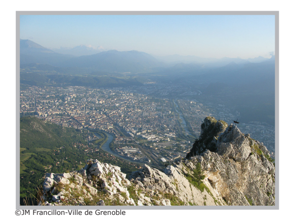
A list of events happening in the city when you're here: http://www.grenoble.fr/