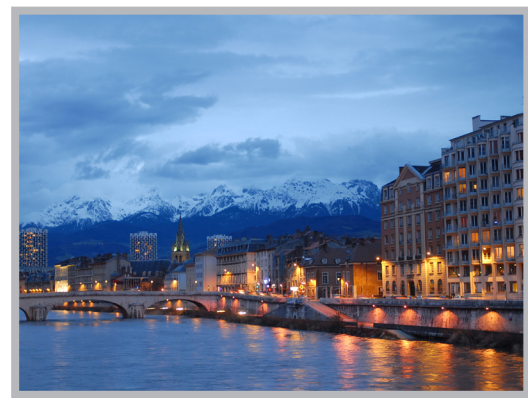
IM Francillon-Ville de Grenoble

«At the end of each street lies a mountain…» As wrote Stendhal, Grenoble is surrounded by mountains, which offers a wide range of leisure activities in summer and winter.