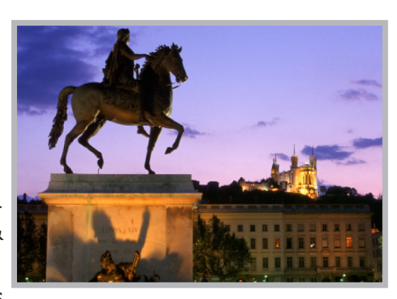
A list of events happening in the city when you're here: http://www.lyon.fr